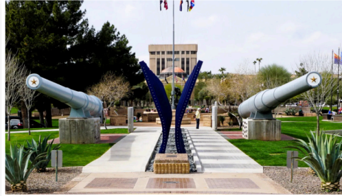
► The Wesley Bolin Plaza at 1700 W. Washington St. in Phoenix.

Separate meetings are also being scheduled with district representa-